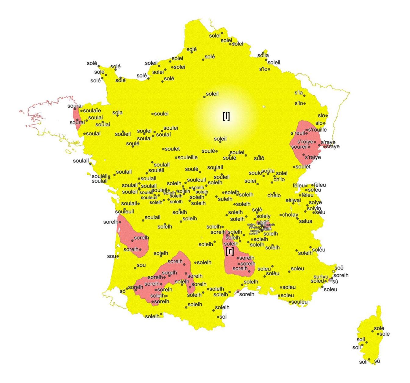
Figure 3: Linguistic map of Romance France for the word soleil ('sun') illustrating phonetic variation — with an intervocalic [1] in yellow and an intervocalic [r] in pink-red.